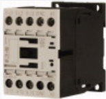
290093 DILM 15-01(230V50HZ,240V60HZ)