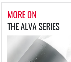
Discover the full potential of the ALVA series.