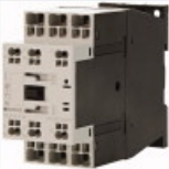
199673 DILM 38-11(220V50/60HZ)-PI