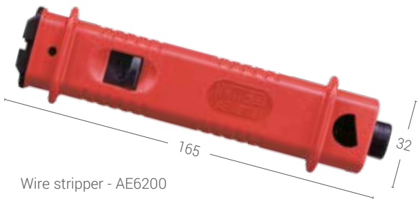
Wire stripper - AE6200