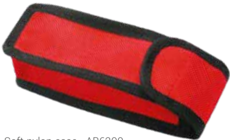
Soft nylon case - AB6200