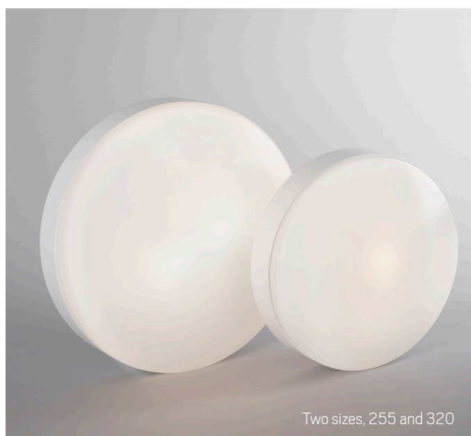
Two sizes, 255 and 320