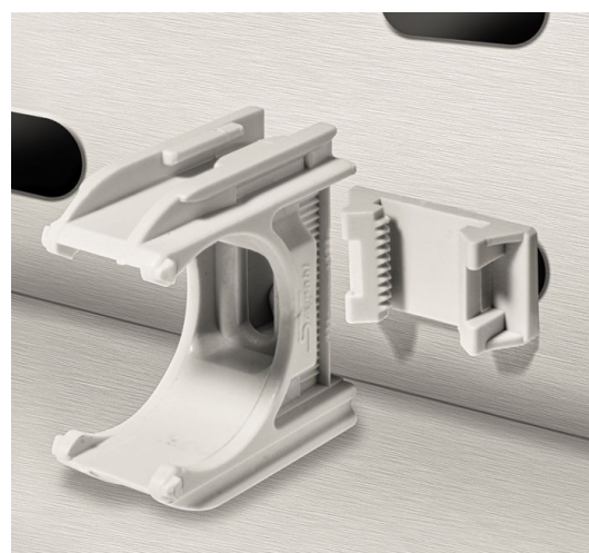
Ideal for fixing pipes to all conventional cable conduits with slotted holes.