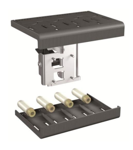
XT2 P Conversion Kit

^{\odot} Copyright 2022 ABB. All rights reserved.