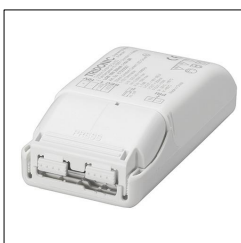
LED drivers LCBI 10W 180mA PHASE-CUT/1-10V SR 87500273