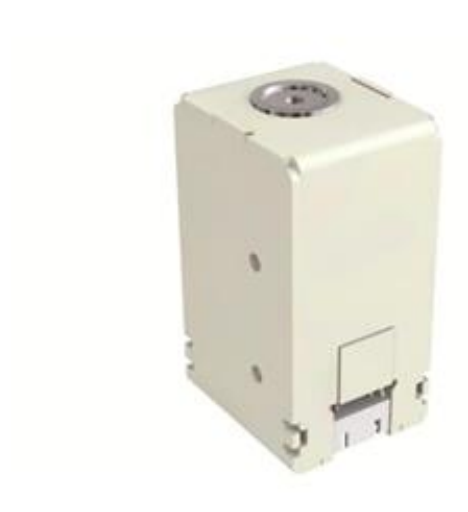
ABB YU / YU-C Coils (IT) August 2024