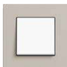
Linoleum- plywood light grey (similar to NCS S 2002-Y)