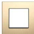
Aluminium light gold