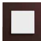
Linoleum- plywood dark brown (similar to NCS S 8005-Y80R)