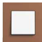
Linoleum- plywood light brown (similar to NCS S 6010-Y30R)