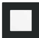
Linoleum- plywood anthracite (similar to NCS S 8502-B)