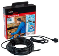
Figure 1: FrostGuard Product Image

Chemelex is a global leader in electric thermal and sensing solutions, protecting the world’s critical processes, places and people. With over 50 years of innovation and a commitment to excellence, we develop solutions that ensure safety, reliability, and efficiency in diverse environments – from industrial plants and data centers to people’s homes. Chemelex delivers future-ready technologies, advanced engineering capabilities and local expertise backed by global standards. Our offering includes a leading portfolio from our trusted brands: Raychem, Tracer, Pyrotenax and Nuheat.