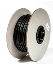
Figure 1: T2Black product image

Chemelex is a global leader in electric thermal and sensing solutions, protecting the world’s critical processes, places and people. With over 50 years of innovation and a commitment to excellence, we develop solutions that ensure safety, reliability, and efficiency in diverse environments – from industrial plants and data centers to people’s homes. Chemelex delivers future-ready technologies, advanced engineering capabilities and local expertise backed by global standards. Our offering includes a leading portfolio from our trusted brands: Raychem, Tracer, Pyrotenax, and Nuheat.