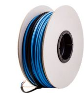
Figure 2: T2Blue product image

The reference product to represent RAYCHEM T2Black cables is R-BK-C-74.0M-1490W/T0. It is an electrical floor heating cable for new build & renovation projects where the cable is installed directly in tile adhesive or in 15-30 mm of screed or self levelling compound (T2Black-12) or in 30-50 mm of screed (T2Black-20). The cable exists in 2 power output variants of 12 W/m and 20W/m and available in pre-terminated lengths (14,5-175 m). The range is composed of installer friendly kits including the cable on a spool and all installation accessories. Variants with or without programmable thermostats are available.