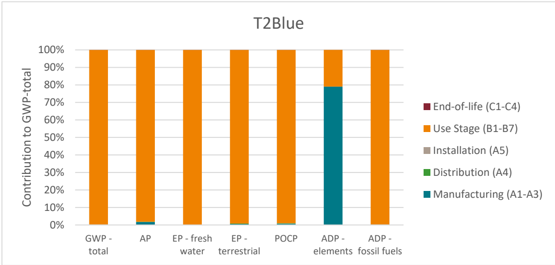
Figure 4: LCA Results for T2Blue, by life cycle stage