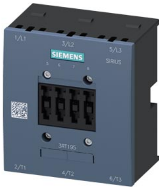
Arc chute for 3RT1055