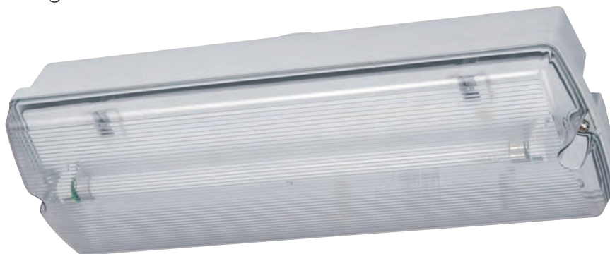
NEBRASKA 1 X 8W T5

IP65 LED or fluorescent slim emergency bulkhead with a range of attachments