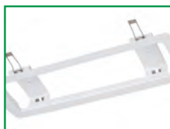
NEBRASKA semi-recessed mounting kit