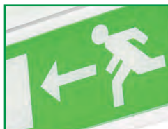
Standard legends available as UP, DOWN, LEFT & RIGHT