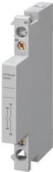
CONTROL SWITCH WITH 2 MAKE CONTACTS FOR AC 230V/400V FOR 5TT58 AND 5TT50