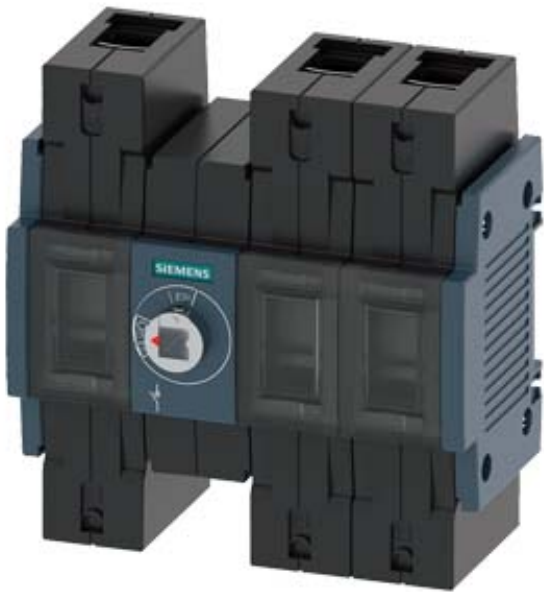
SWITCH-DISCONNECTOR 100A, FRAME SIZE 2, 3-POLE FRONT OPERATING CENTER BASIC UNIT WITHOUT HANDLE BOX TERMINAL