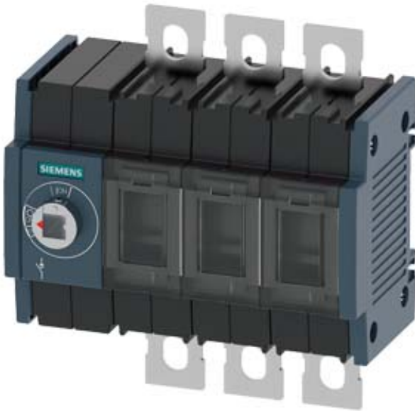
SWITCH-DISCONNECTOR 125A, FRAME SIZE 2, 3-POLE FRONT OPERATING LEFT BASIC UNIT WITHOUT HANDLE FLAT TERMINAL INCL. PHASE BARRIERS