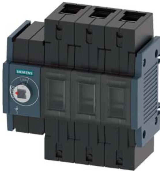
SWITCH-DISCONNECTOR 125A, FRAME SIZE 2, 3-POLE FRONT OPERATING LEFT BASIC UNIT WITHOUT HANDLE BOX TERMINAL