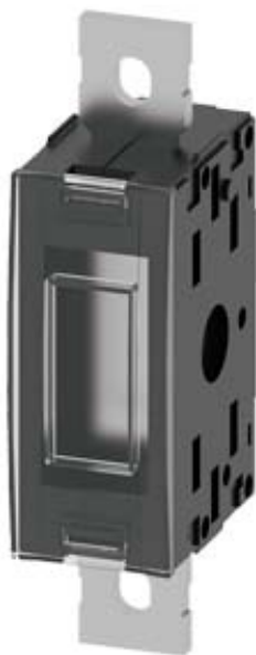
ACCESSORY FOR 3KD FRAME SIZE 4 N/PE TERMINAL WITH PERMANENT JUMPER FLAT TERMINAL