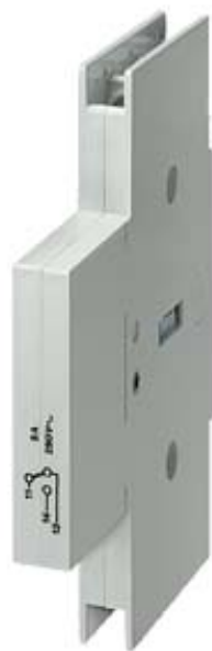
AUXIL. CONTACT SWITCH, 92MM 6A 1CO CONTACT