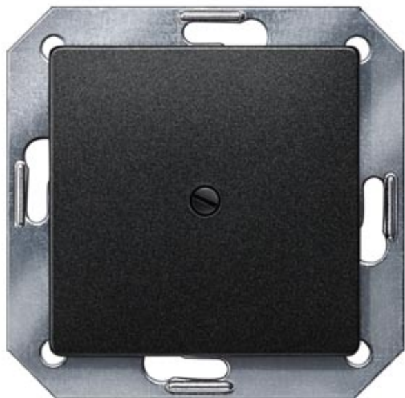
I-SYSTEM, CARBON METALLIC BLANKING PLATE, 55X55M