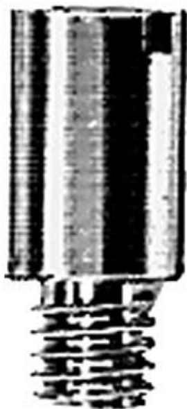
TEST SOCKET 2.3MM