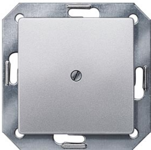
I-SYSTEM, ALUMIN.METALLIC BLANKING PLATE, 55X55M