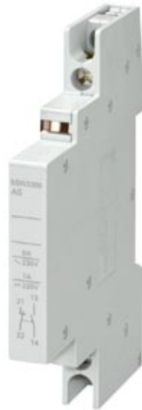
AUXILIARY SWITCH ATTACHABLE F. RES.CURRENT OP.CIRC. BREAKER F. 16 TO 80A, 1NO+1NC