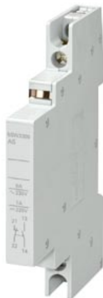
AUXILIARY SWITCH ATTACHABLE F. RES.CURRENT OP.CIRC. BREAKER F. 16 TO 80A, 2NC