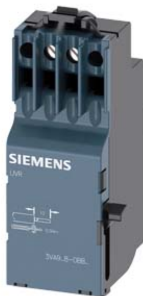
UNDervOLTAGE RELEASE 12 V DC ACCESSORY FOR 3VA1 100/160 3VA2 100/160/250/400/630