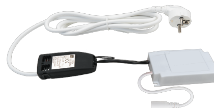
SENSE 1050mA /4000lm DRIVER NON DIM