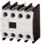
277953 DILM 150-XHIV22