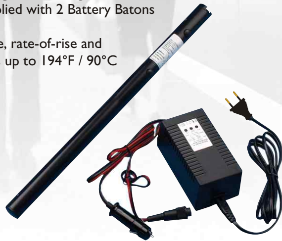
Solo 760 Battery Baton