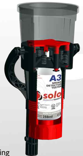
Solo 330 for use with Solo A3 & C3 Aerosols

Solo 332 is available for detectors with larger bases.