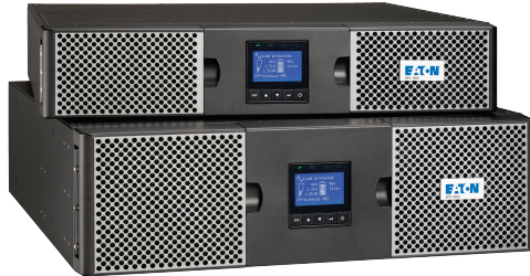
9PX Marine UPS