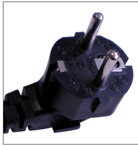
2 Pin DIN49441 Plug