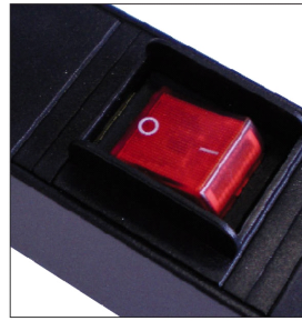
LED Shrouded Switch