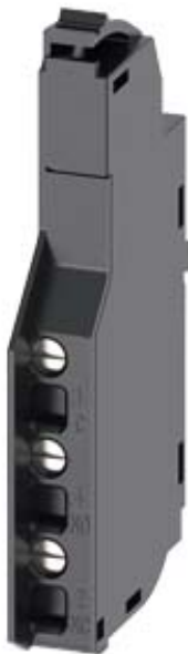
AUXILIARY SWITCH CHANGEOVER CONTACTS TYPE HQ (7MM) ACCESSORY FOR 3VA-BREAKER