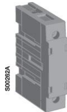
ABB AS, Low Voltage Products