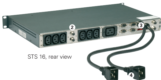
STS 16, rear view