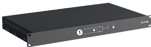
STS 16, front view